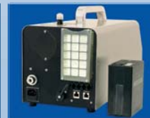
Optional Li-Ion Battery