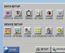
User Friendly Configuration