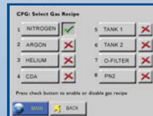
User-Customizable Gas Sample Recipes