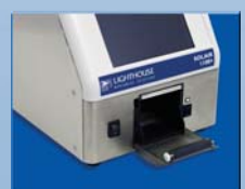
Easy Loading Thermal Printer