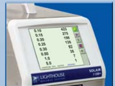
Zoom Screen Functionality