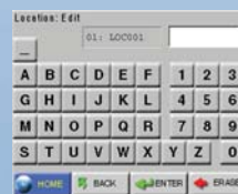
Alphanumeric Location Labels