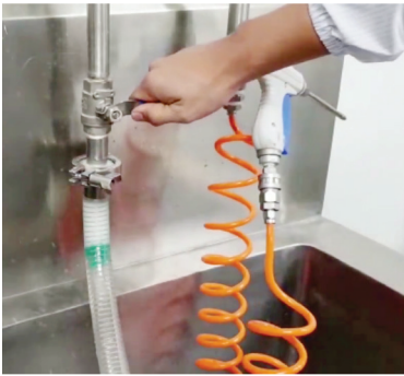
ErgoSCRUB® Swab Tips can be detached to clean USP flexible hoses