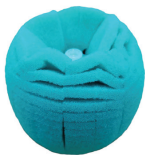
ErgoSCRUB® Swab with Sahara Scrubbing Foam Tip