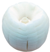
ErgoSCRUB® Swab with UltraSORB+ Foam Tip