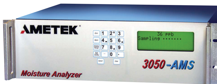
Model 3050-AMS Moisture Analyzer

The Model 3050-AMS responds quickly to both increases and decreases in moisture concentration because the analyzer