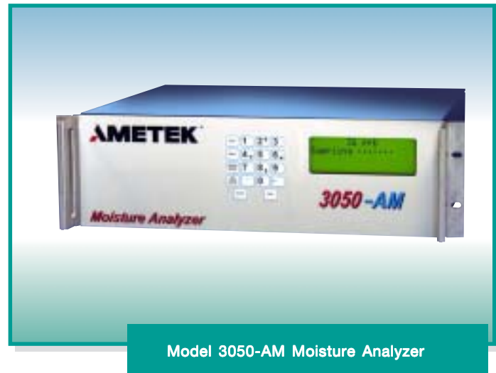
Model 3050-AM Moisture Analyzer

The Model 3050-AM combines the excellent multi-gas compatibility of the Model 2850 with a new, easy-to-use operator interface. It is completely compatible with virtually all non-corrosive gases including inerts (He, Ar,